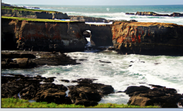
Point Arena-Stornetta Unit of the California Coastal National Monument

Head out for a bluff trail hike or meander into the beach coves. Take the trail behind City Hall or head out on Lighthouse Road.