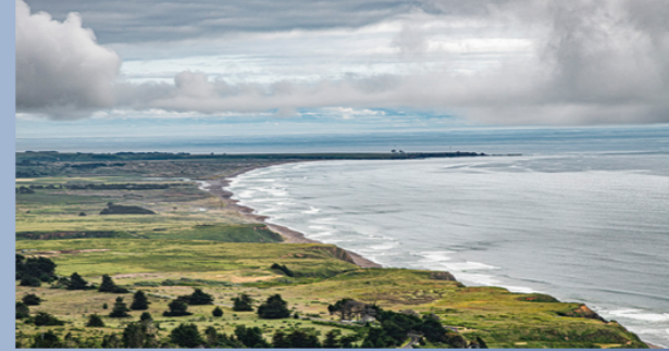
Manchester State Park

5 mile beach. Beautiful hiking and camping. Access via Stoneboro Road, Kinney Road or Alder Creek Beach Road (from PA head north on Hwy 1). San Andreas Fault at north end near Alder Creek.