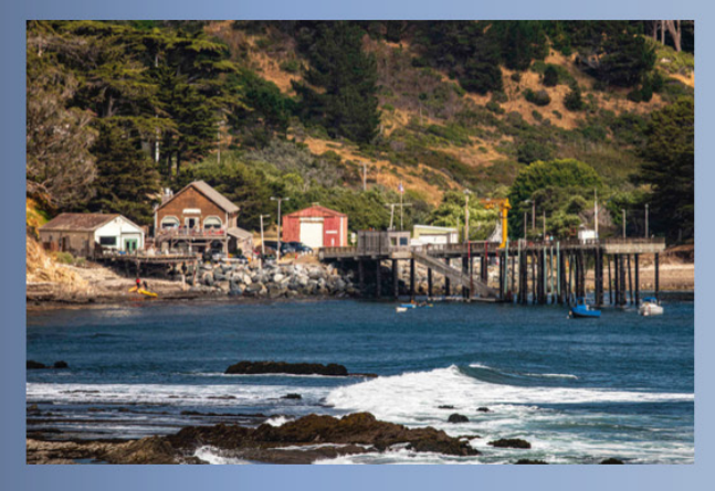
Arena Cove & Point Arena City Pier 810 Port Rd

Weather Forecasts, Tides, Road Conditions at PointArena.net/fyi